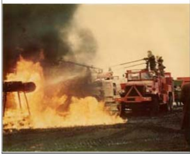
Volume 4, 2006

Legendary Pioneers Who Reminisce About the Past but Focus on the Future