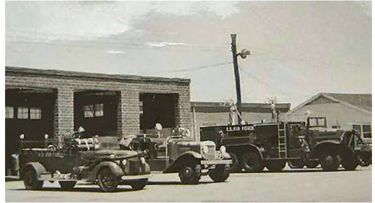
“Class 500 & 750 Pumpers and Type 0-5 Crash Truck” at Craig AFB Fire Station in Alabama (1949).

That’s a wrap for this quarter. I enjoy the networking with each one of you.