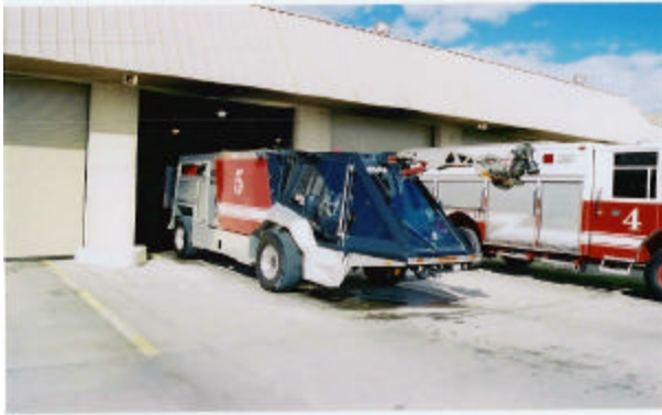
“CRASH 5”, a P-19 Jaguar at Nellis AFB Fire Station in Nevada. (2004).