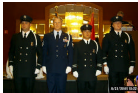
The Peterson AFB Color Guard